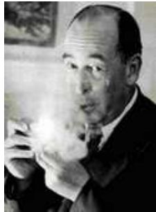
C S Lewis

His sweeping dismissal of Biblical prophecy is almost triumphant in tone.