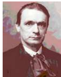
Rudolph Steiner Occult Magus

Given that he was inviting high level occult practitioners into his personal circle, and that they in turn were closely associated with some of the most Lucifer-imbued people of the 20 th century, there can be no doubt that Lewis himself was heavily exposed to demonic influences.