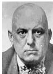
Aleister Crowley Black Magician