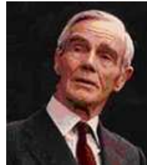
Owen Barfield occult practitioner

Williams had actually been a member of the Golden Dawn, a group dedicated to the study of advanced witchcraft. Its membership included Aleister Crowley, one of the most Satanic black adepts of the 20 th century. Lewis was also greatly influenced by Owen Barfield whom he described as “the best and wisest of my unofficial teachers.” Barfield was an internationally recognised authority on Anthroposophy, an occult offshoot of Theosophy founded by the Austrian magus, Rudolph Steiner, in 1912. He even co-authored several books with Steiner. Like Madame Blavatsky, Steiner taught that Lucifer, the Light Bearer, was the true instructor in the divine mysteries.